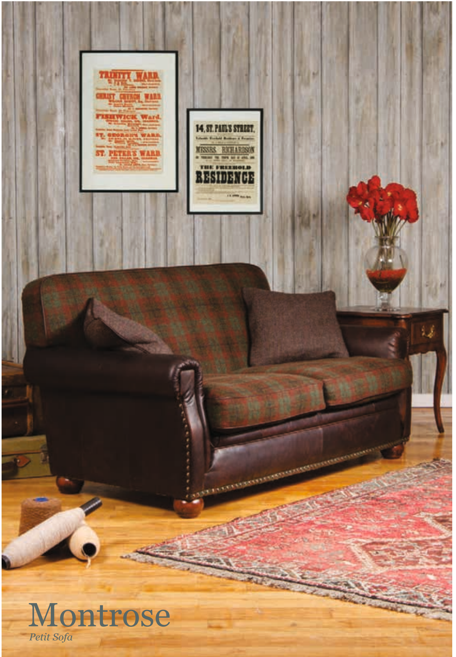
Montrose Petit Sofa