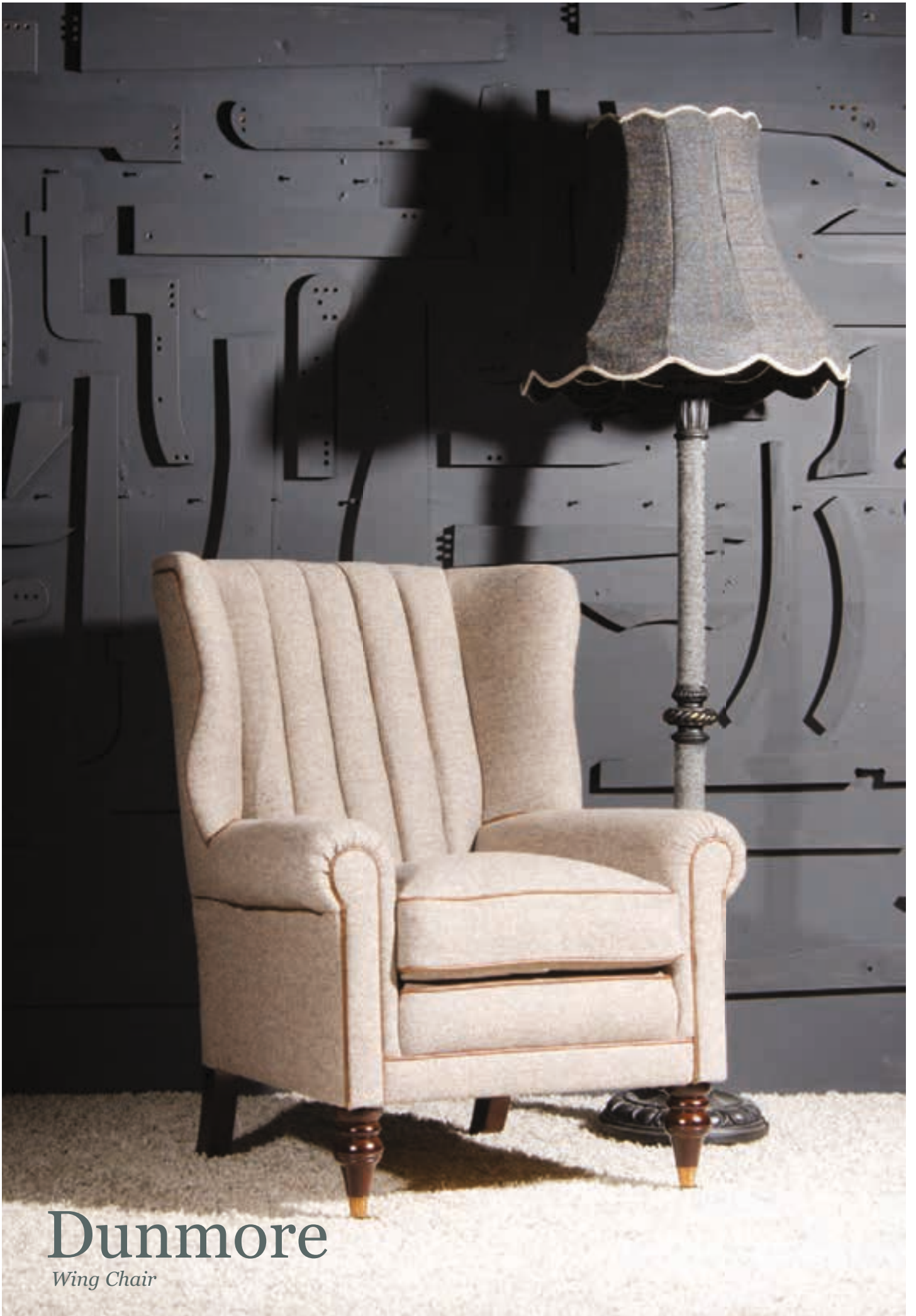
Dunmore Wing Chair