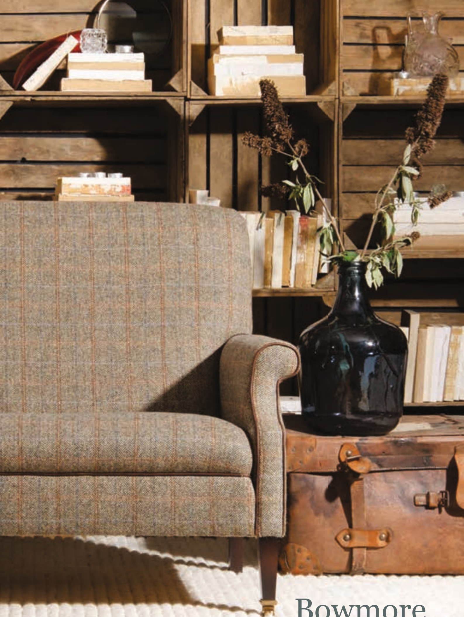
Bowmore Compact Sofa