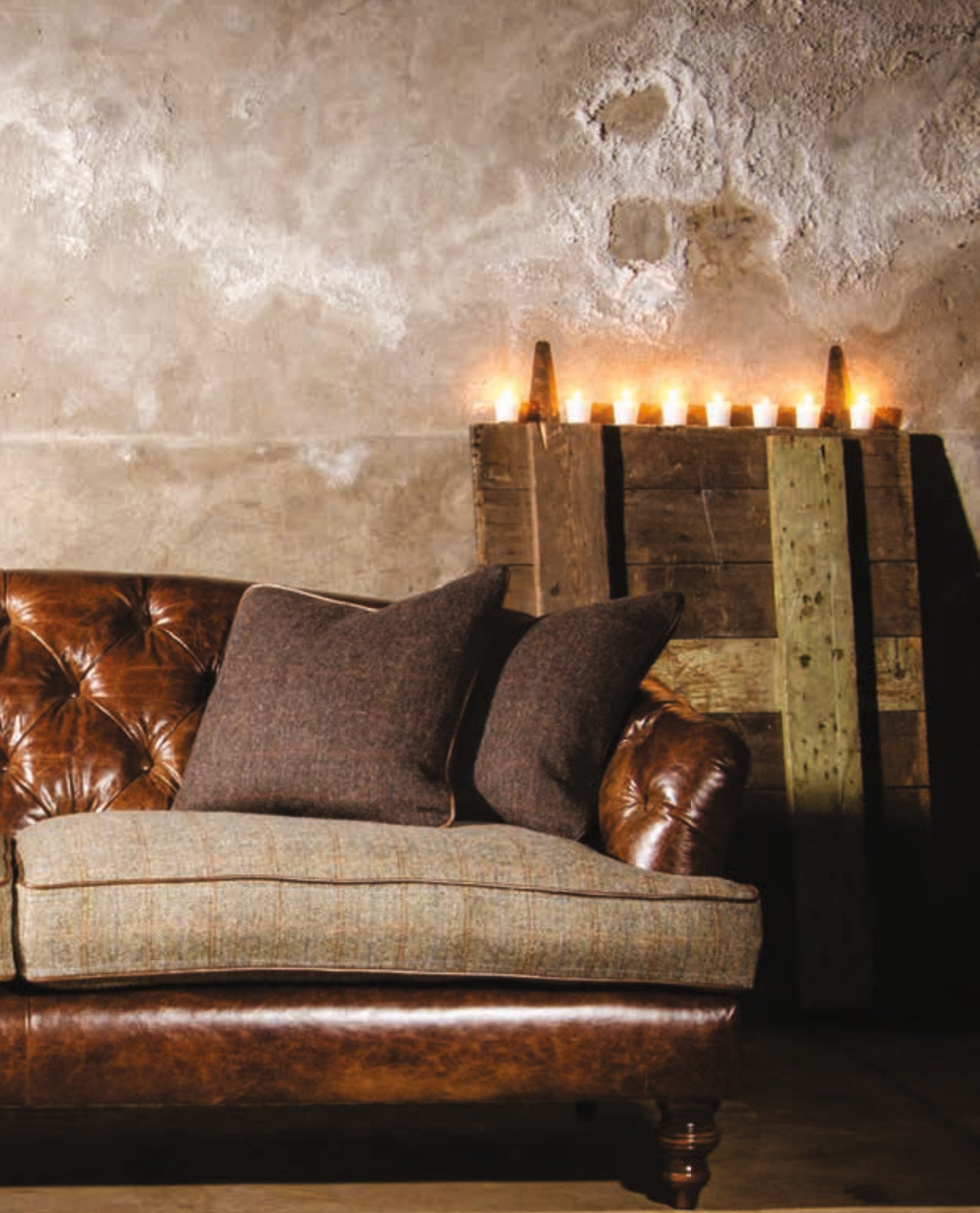
Dalmore Midi Sofa