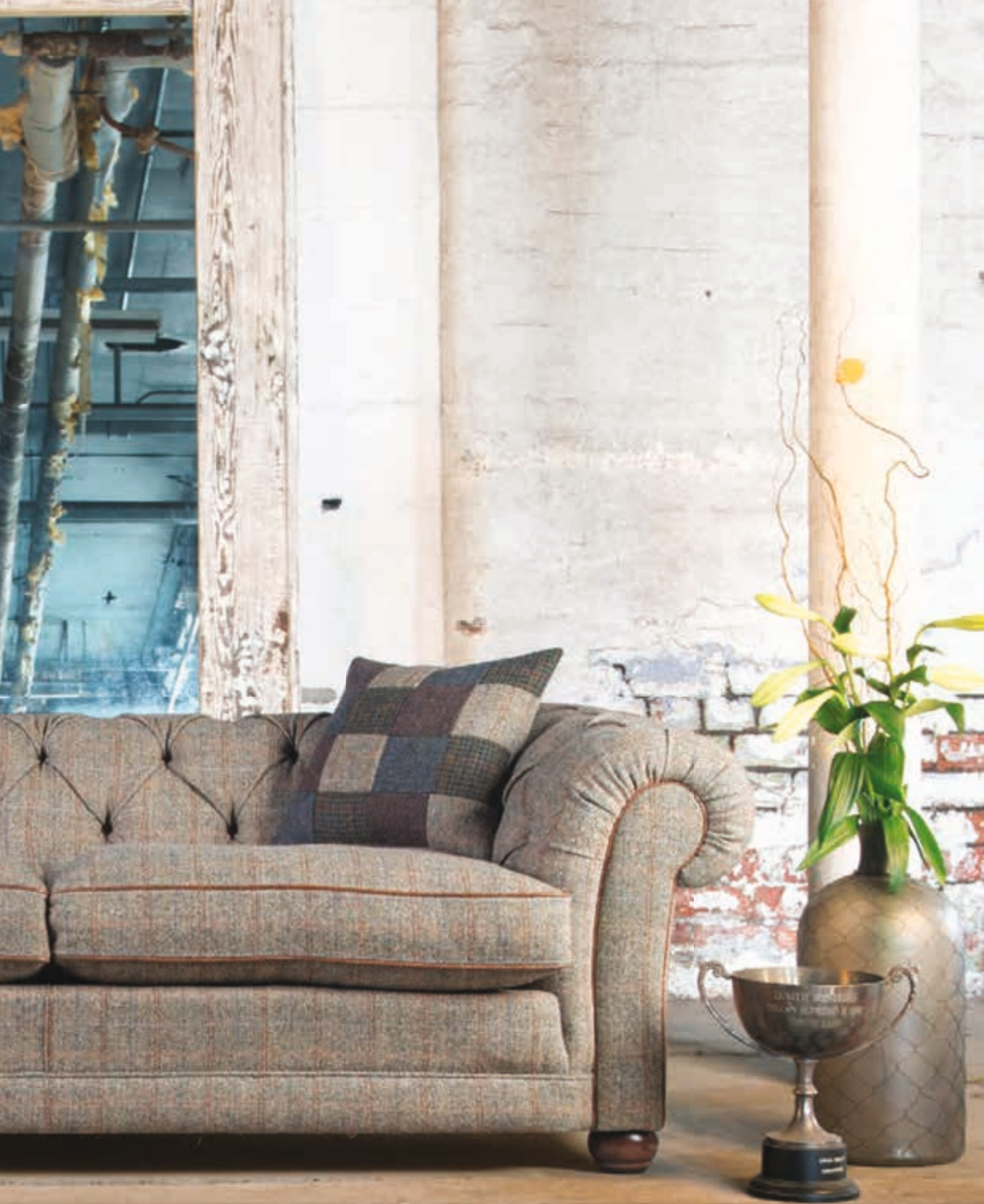
Castlebay Midi Sofa