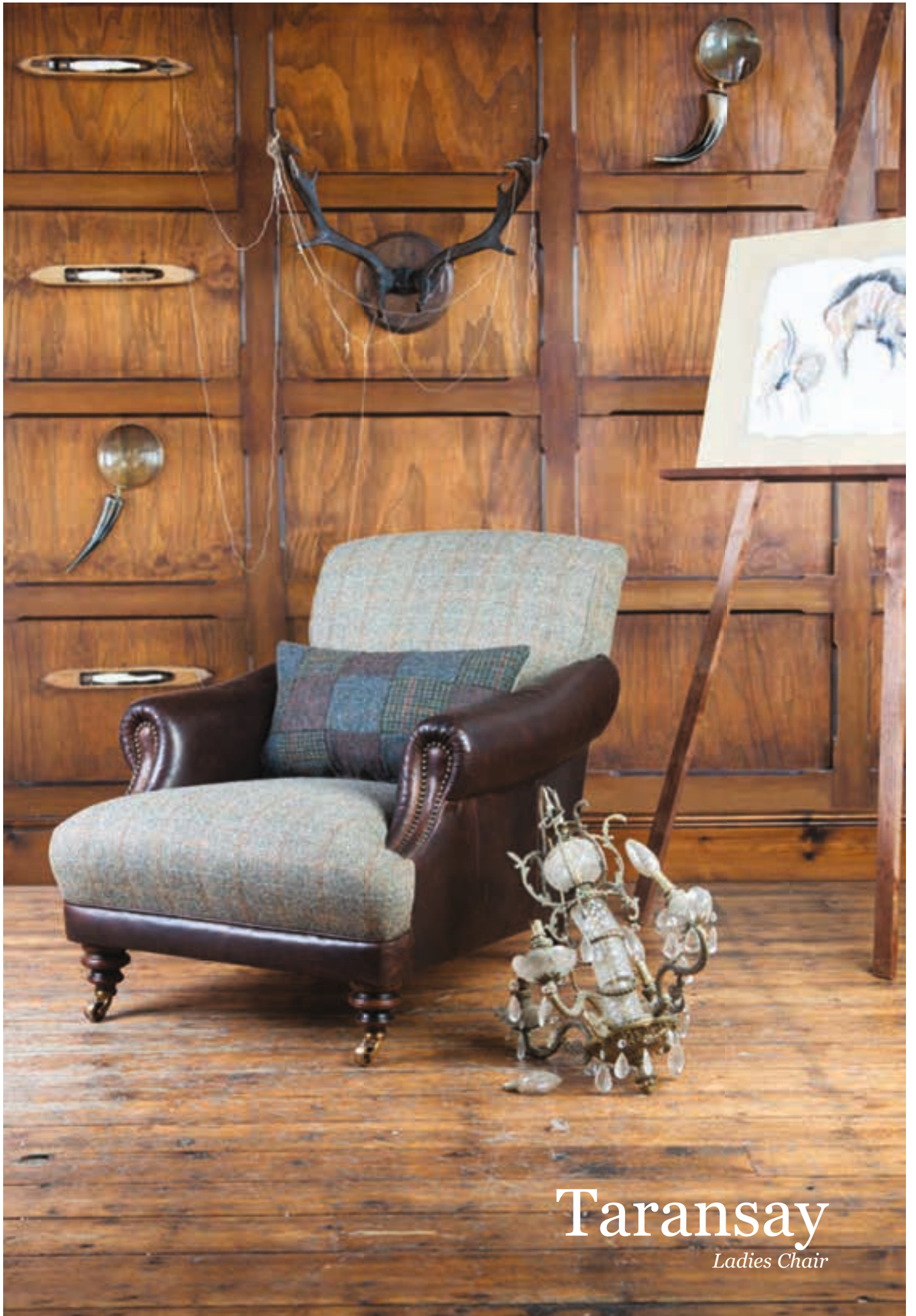
Taransay Ladies Chair